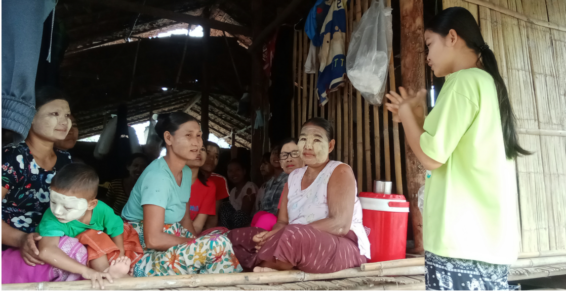
Ongoing conflict in multiple states and regions in Myanmar continues to drive temporary new displacements. With UNICEF support, more than 1,100 displaced people in temporary settlements along the Thailand–Myanmar border have been reached with hygiene promotion activities.