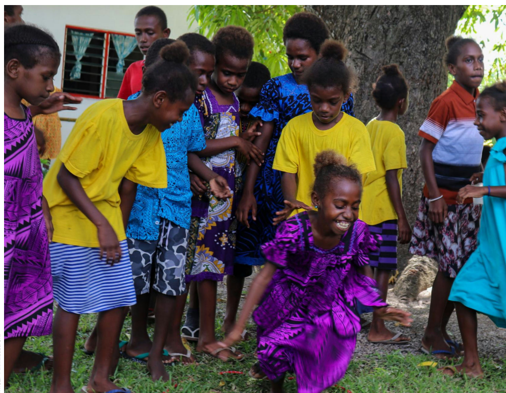
Children on the island of Nguna in Vanuatu enjoy play-based psychosocial support activities after twin Tropical Cyclones Judy and Kevin destroyed much of their community in March 2023.

An estimated 58,000 children required humanitarian assistance after back-to-back cyclones hit Vanuatu in early March 2023.